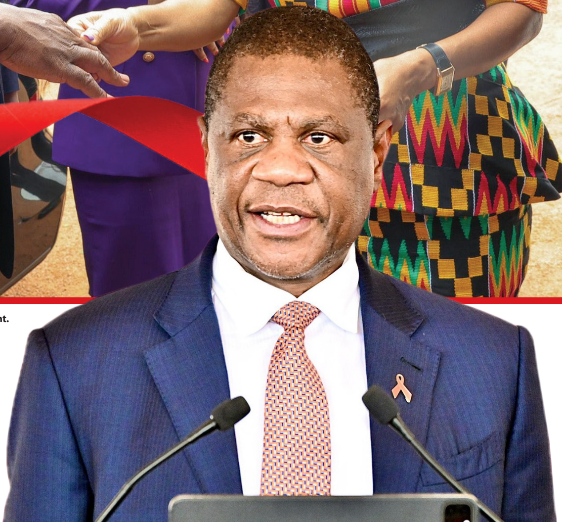
Deputy president Paul Mashatile.

theme encouraged the revitalisation of strategies aimed at closing gaps in prevention and treatment, and emphasised the importance of making long-term investments, especially in light of funding cuts and changing global priorities that impact HIV investment. Mashatile said the introduction of lenacapavir, a long-acting preventative treatment, is set to change the landscape of HIV prevention in South Africa.