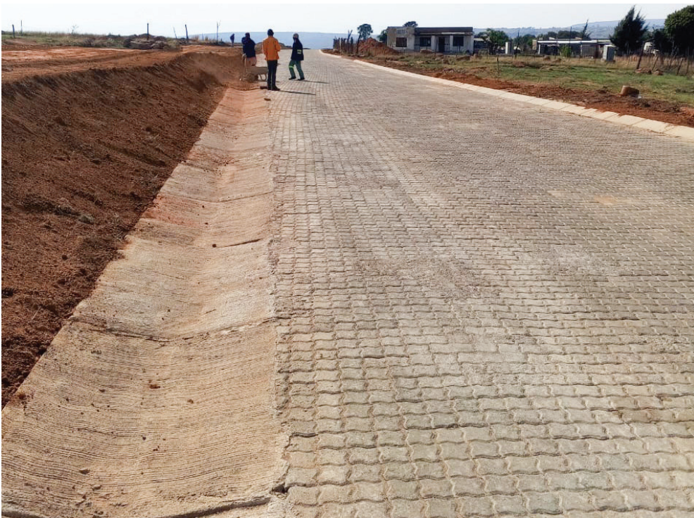
The long-awaited Maraneng Road Project in EMLM Ward 15, which is set to improve mobility in the area, is expected to be completed soon.

MARANENG - The long-awaited transformation of Maraneng Village in Elias Motsoaledi Local Municipality (EMLM) Ward 15, is nearing completion, with the R30.9 million road and storm-water upgrade project reaching 99% completion.