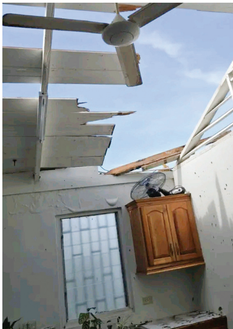
The recent violent storms wreaked havoc in Dennilton and Diphale leaving multiple families homeless.

Affected residents are advised to contact the Limpopo Provincial Disaster Management Centre toll-free number on 0800 222 111, for reporting emergencies.