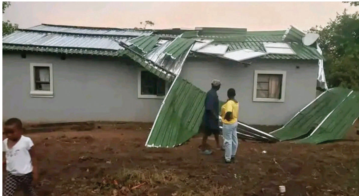
The recent violent storms wreaked havoc in Dennilton and Diphale leaving multiple families homeless.

DENNILTON/DIPHALE - A powerful violet storm accompanied by heavy rain and strong winds ravaged Ntwane Village in Dennilton, Elias Motsoaledi Local Municipality (EMLM) on Sunday 30 November 2025, leaving a trail of destruction and residents without homes.