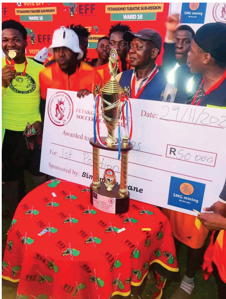
Gordons won the FTLM Ward 16 league