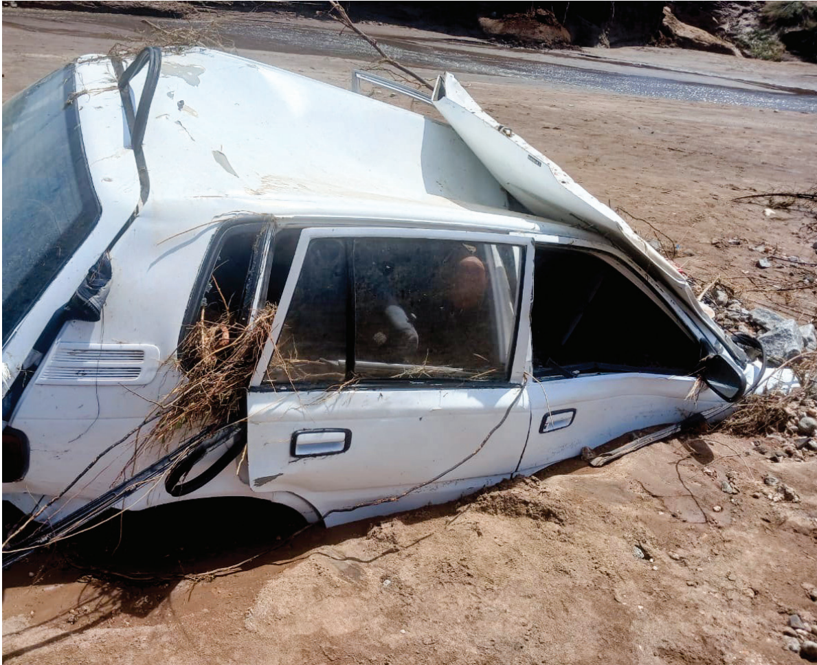
The vehicle used by the missing man