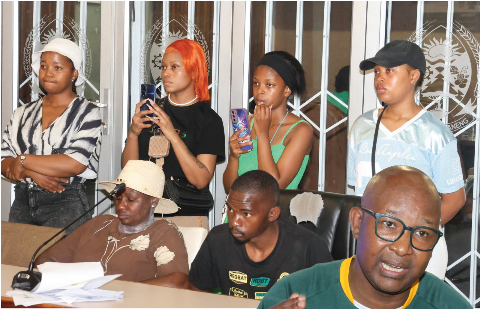
Young people from the different parts of EMLM came in numbers to attend the Youth Business Training and Funding Workshop.

vital in unlocking opportunities and empowering the youth to actively participate in the local economy," he added.